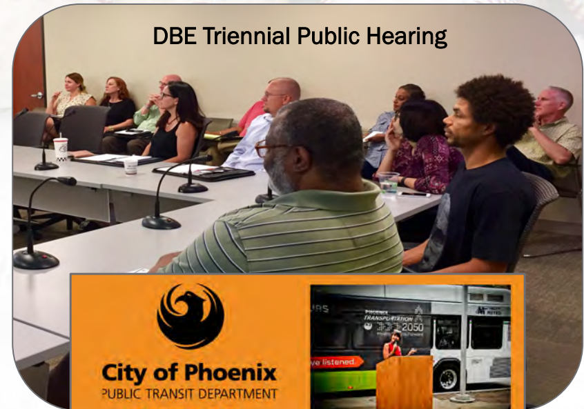
DBE Triennial Public Hearing