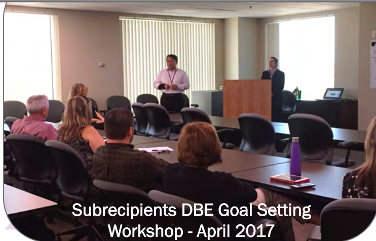
Subrecipients DBE Goal Setting Workshop - April 2017

The Phoenix Public Transit Department proposes a DBE triennial goal of 5.98 percent for all FTA funds expended for federal fiscal years 2018-2020.